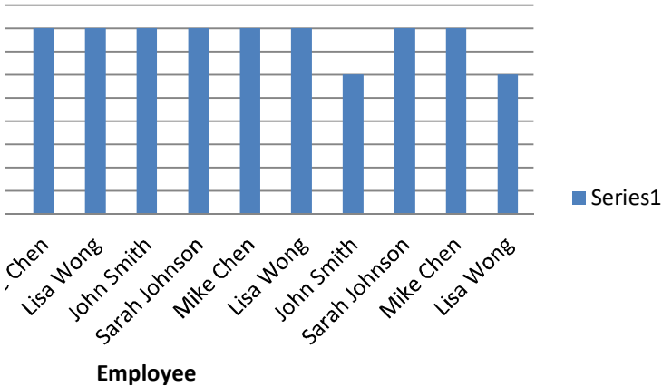
Hours Worked by Employee